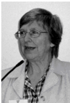
Professor Pam Peters

Following morning tea, Professor Pam Peters (Dictionary Research Centre, Macquarie University) presented the second keynote address: 'Language on the move'. Professor Peters used a series of examples of English borrowings from classical languages, for example the spelling of words like 'h(a)emoglobin' and plurals of words like 'retina', to show the ongoing process of assimilation that underlies the surface variation in the spelling of such words. Significantly, the variable forms of words have