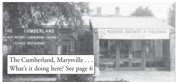
The Cumberland, Marysville . . . What's it doing here? See page 6