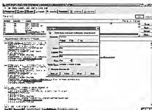
Figure 2. Library Literature search screen showing the Search+ dialog box.