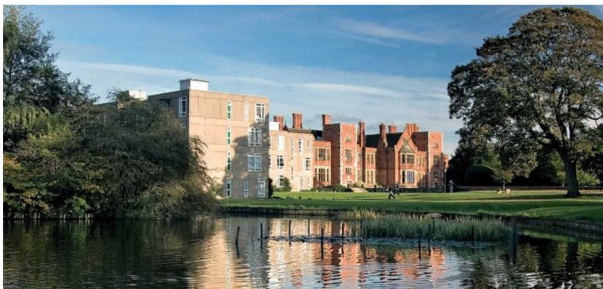
View of Derwent College and Heslington Hall, University of York