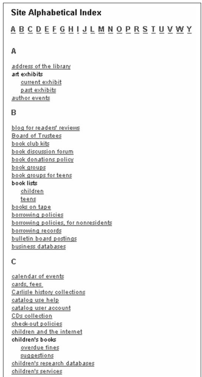
Figure 1 An excerpt example of a website index from a public library

Even when focusing on the narrow field of editorial web indexing tools, the products available are quite varied. Software tools for creating HTML indexes are of three kinds: